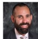
Dr. Ben Proctor

The Kansas State Department of Education does not discriminate on the basis of race, color, religion, national origin, sex, disability or age in its programs and activities and provides equal access to the Boy Scouts and other designated youth groups. The following person has been designated to handle inquiries regarding the nondiscrimination policies: KSDE General Counsel, Office of General Counsel, KSDE, Landon State Office Building, 900 S.W. Jackson, Suite 102, Topeka, KS 66612, (785) 296-3201