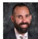
Dr. Ben Proctor

The Kansas State Department of Education does not discriminate on the basis of race, color, religion, national origin, sex, disability or age in its programs and activities and provides equal access to the Boy Scouts and other designated youth groups. The following person has been designated to handle inquiries regarding the nondiscrimination policies: KSDE General Counsel, Office of General Counsel, KSDE, Landon State Office Building, 900 S.W. Jackson, Suite 102, Topeka, KS 66612, (785) 296-3201