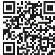
Degree Stats Kansas Board of Regents.

Ensure the distribution of the degree prospectus information published by the state board of regents in accordance with K.S.A. 74-32,303 , the Kansas training information program report published in accordance with K.S.A. 74-32,418 , and any other information relevant to students' understanding of potential earnings as determined by the department of labor and the potential earnings published by each branch of the armed services of the United States military to students 7-12 grades and their families by October 15 th each year.