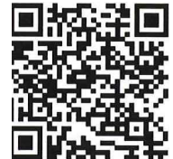
Kansas Training Information Program (K-TIP)